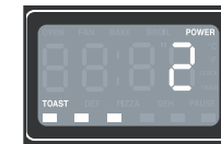
Medium light toast (default setting)