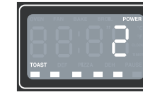
Medium dark toast