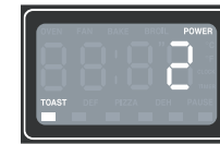
Very light toast