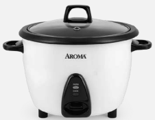
Rice & Grain Cookers