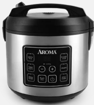
Digital Rice & Grain Multicookers