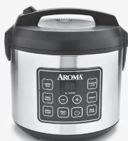
Multicookers/ Rice Cookers