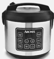
Multicookers/ Rice Cookers