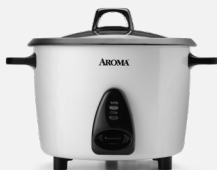
Pot-Style Rice Cookers