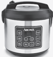
Multicookers/ Rice Cookers