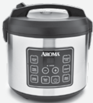
Multicookers/ Rice Cookers