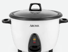
Rice & Grain Cookers