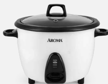
Rice & Grain Cookers