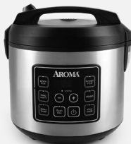
Digital Rice & Grain Multicookers